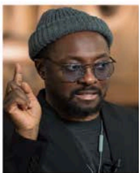
Will I. Am

We would like to issue a special thanks and recognize the following prior speakers of digital.davos (2019-2020) for their extraordinary dedication in helping the children from Parkland, with fostering new business development, motivation , immigration, and data privacy & security.