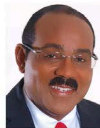
Gaston Browne Prime Minister of Antigua and Barbuda